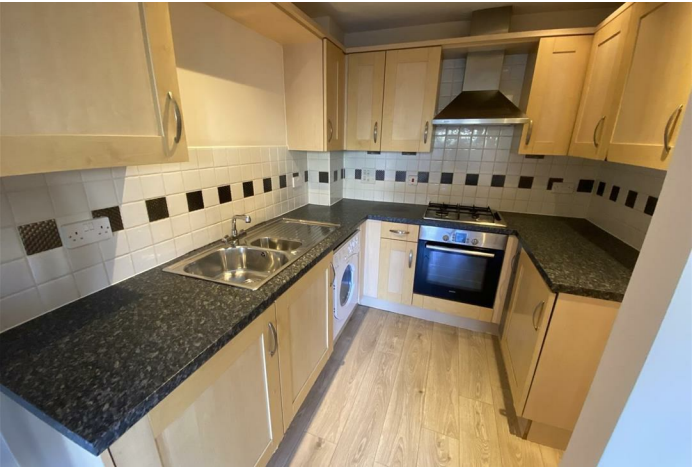
APARTMENT (EPC RATING: C)